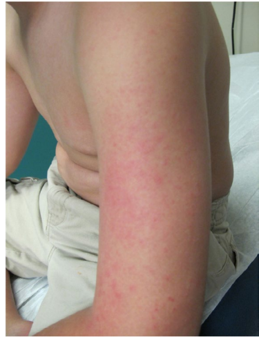
Figure 2: Diffuse Maculopapular Pruritic Rash, a Dermatological ID Reaction Manifestation.