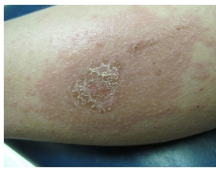
Figure 1: Primary Impetigo Lesion Partially Altered in Appearance due to the Recent Application of Topical Corticosteroids.

The patient was well appearing, well developed and well nourished with no acute distress. He had no signs of anaphylaxis with normal cardiac, lung, and abdominal exams. An eczematous erythematous fine maculopapular rash was limited to torso and extremities excluding mucous membranes, hands, feet, and groin as seen in the following images. The left lower extremity had a notable round 1 cm crusted plaque with excoriation on an erythematous base. Head, eyes, ears, neck, and throat (HEENT) exam was unremarkable without conjunctivitis, oral lesions, facial swelling, lymphadenopathy or erythema.