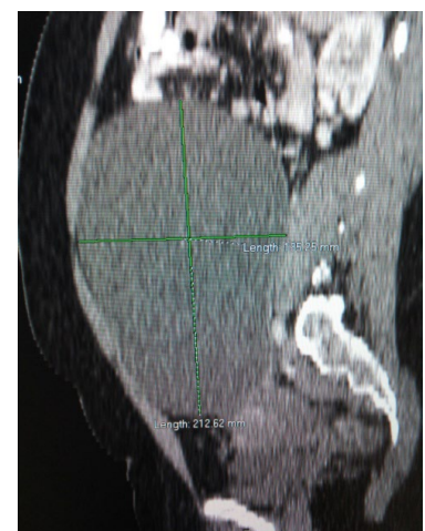
Figure 2: Computed tomography.