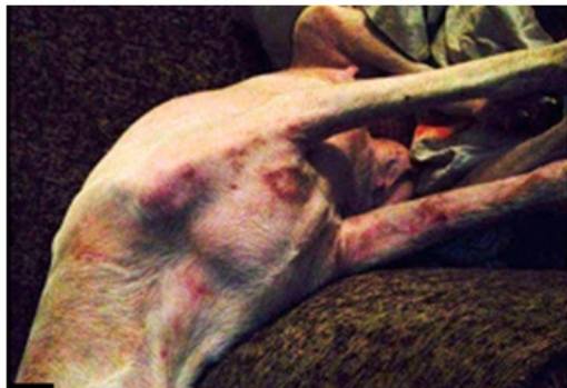
Figure 1: Clinical Presentation of Littermate Dogs Showed Bilateral Reddish Patches of Alopecia on Abdomen, Chest, and Medial Aspect of the Fore Limbs.