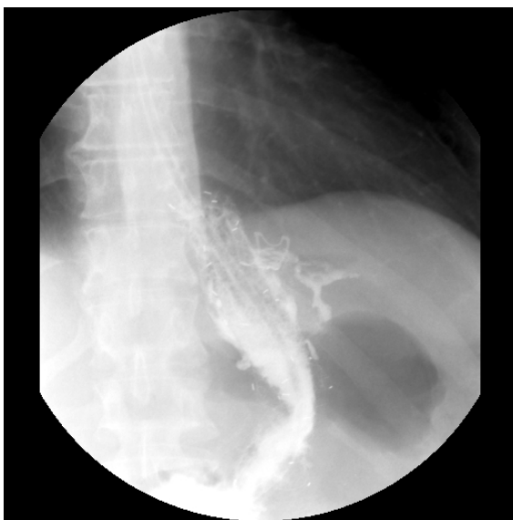
Figure 2: Barium swallow of case 2 patient after failure to control the gastric leak (V) by a metallic clip (arrow).

Case 2: A 46-year-old male with DM type 2, hepatitis B, hypertension, MO and DCM, was operated on with a VEF of 27%. On physical examination, a BMI of 37 kg/m 2 was the most relevant finding. During the SG, the last cartridge of the stapler failed and the patient developed a leak near the esophagogastric junction, albeit a prompt reoperation was done during the first 48 hours. All the subsequent therapeutic approaches with stents, glues or metallic clips were unsuccessful (Figure 2) and finally, a total gastrectomy was performed, with an excellent recovery. 18 months after the first bariatric procedure, the patient showed an improvement of 10% in his VEF as well as in his co-morbidities.