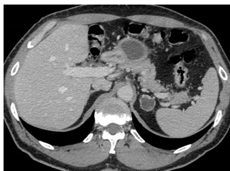
Figure 1: Axial contrast-enhanced CT image showing a rounded lesion interpreted as the upper portion of the left adrenal gland with sharp edges and weak parietal enhancement.

After 6 months the patient underwent a second follow-up CT that showed a little intralesional gas bubble (Figure 2); CT scan was subsequently repeated after oral administration of contrast medium (Gastrografin ® ); the previously described lesion showed continuity with the gastric wall, contrast medium staining of the lumen lesion with contextual air bubbles suggestive of gastric diverticulum (Figure 3 and 4). Diagnosis was later confirmed by esophagogastroduodenoscopy.