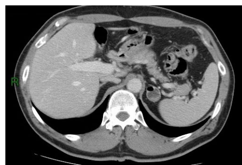
Figure 2: Axial contrast-enhanced CT image showing a gas bubble in the ventral aspect of the suprarenal lesion.