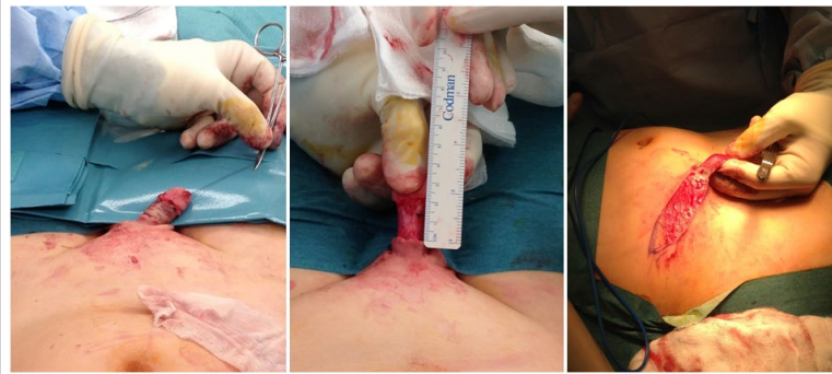
Figure 2: Intra-operative Pictures Demonstrating Releasing of the Skin, the Resulting Skin Deficit and the Harvesting of Skin from the Anterior Abdominal Wall.

The patient was admitted for 48 hours under observation and analgesia. The dressings were left intact for 48 hours and when the dressing was taken down the graft was healthy and viable. At the time of discharge the graft and donor site were healing well. Community nurses managed daily dressings for a further three weeks. Analgesic requirement was minimal and managed in the community (Figure 3).