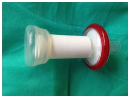
Figure 1: The extra-tracheal device.

The extra-tracheal device was set up with a silicone adapter mounted on a cardboard mouthpiece and a filter (Figure 1). The specific adapter silicone was well tolerated by the patient. The appropriate adapter was used to perform spirometry in patients with alterations in the margins of the stoma skin, with an irregular diameter and not only adhering to the cardboard mouthpiece.