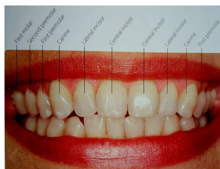
Figure 1: Smile analysis.

Keep in mind that people don't always look at you directly from the front. Consider the angles at which people are most likely to view you. For example, if you are short, most people look at you from above. Therefore, pay particular attention to your lower teeth, especially the biting edges. (Figure 1)