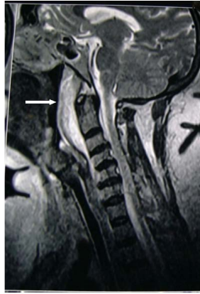
Figure 1: Retropharyngeal abscess in MRI neck (white arrow).