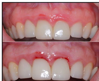
Figure 6: The upper image shows pre-incisional biopsy and the lower image shows immediately post-biopsy from gingival margins of #8 and #9.