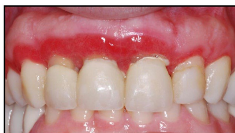
Figure 3: At five weeks post-surgery and three weeks post-Barricade dressing removal, the patient presented with severe gingival erythema mimicking desquamative gingivitis (DG).