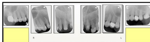
Figure 2: Periapical radiographs showing impingement of the biological width.