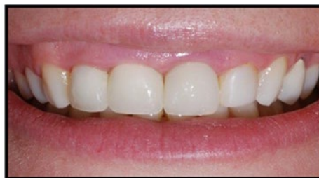
Figure 1: Clinical image at initial presentation shows a high "gummy" smile with provisional crowns.

At 12 weeks post-surgery marked improvement was observed but the lesion had not completely resolved (Figure 4).