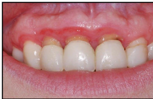
Figure 4: At 12 weeks post-surgery, and after using systemic Prednisolone for 15 days, the lesion was improved but had still not resolved.

Although excisional biopsy has been proposed as the correct treatment for oral focal mucinosis, this was not performed in this case. Rather, incisional biopsy was performed due to the