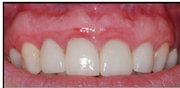
Figure 5: One year, post-crown lengthening with All-Porcelain permanent crowns. After one year the erythematous lesion was significantly reduced.