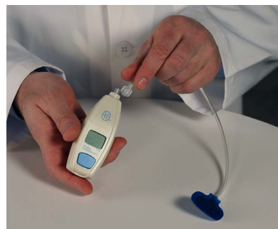
Figure 1C: The UES Assist Device is fit by the physician, using the External Manometer connected by a luer lock to the Pressure Sensor. As the UES Assist Device is adjusted, the pressure being applied in mmHg, is displayed in real time. Once the device fitting has been completed, the Pressure Sensor is disconnected, as each Pressure Sensor is a one-time use component.