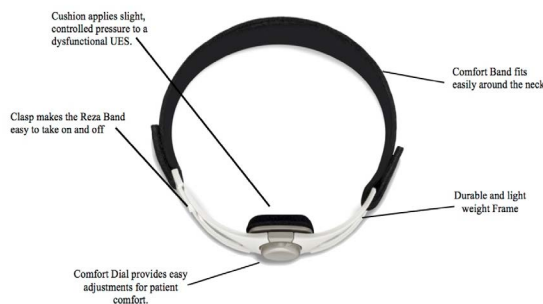
Figure 1A: Overview of the UES Assist Device. Cushion is placed at the patient's cricoid with the Comfort Band attached to the frame body, by a magnetic Clasp. Physician fit the patient according to pressure required and patient comfort, by adjusting the Comfort Band. Patient is allowed some adjustment to the pressure, using the Comfort Dial.

The study was a non-randomized, prospective, open label trial of 95 patients at 5 investigational sites in the United States to assess the safety and effectiveness of the Reza Band ®