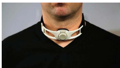
Figure 1B: UES Assist Device positioned at the cricoid on a patient while sleeping.