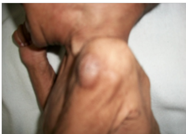
Figure 1: Showing features of Severe Acute Malnutrition (SAM) and abscess at BCG site.

Acute Malnutrition (SAM) in form of wt/ht <-3 SD and features of visible severe wasting. There were multiple non tender, non erythematous nodules over the trunk and abscess present over the BCG site over left arm with regional adenopathy as seen in Figure 1.