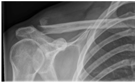
Figure 1: Anteroposterior (AP) radiograph of the right clavicle.