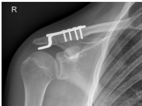
Figure 3: AP radiograph of the right clavicle six weeks after open reduction and internal fixation using a hook plate.