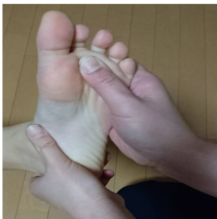
Figure 1: Reflexology is the Gentle Manipulation or Pressing of Certain Parts of the Foot to Produce an Effect Elsewhere in the Body.

The lymphatic reflexology technique can be used to treat specific conditions, such as leg, foot and generalized edema, as it moves extravascular fluid without disturbing the intra-